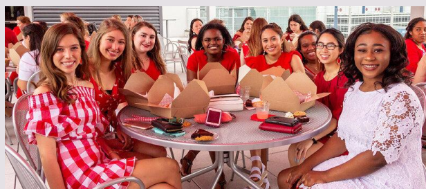
Members of the Class of 2019 at their Red Check Luncheon

We have a special schedule for Thursday, May 20, to better accommodate our Senior Luncheon and the Red Check performance. Click the image to the left to see how we've organized the day or click here for a printable version .